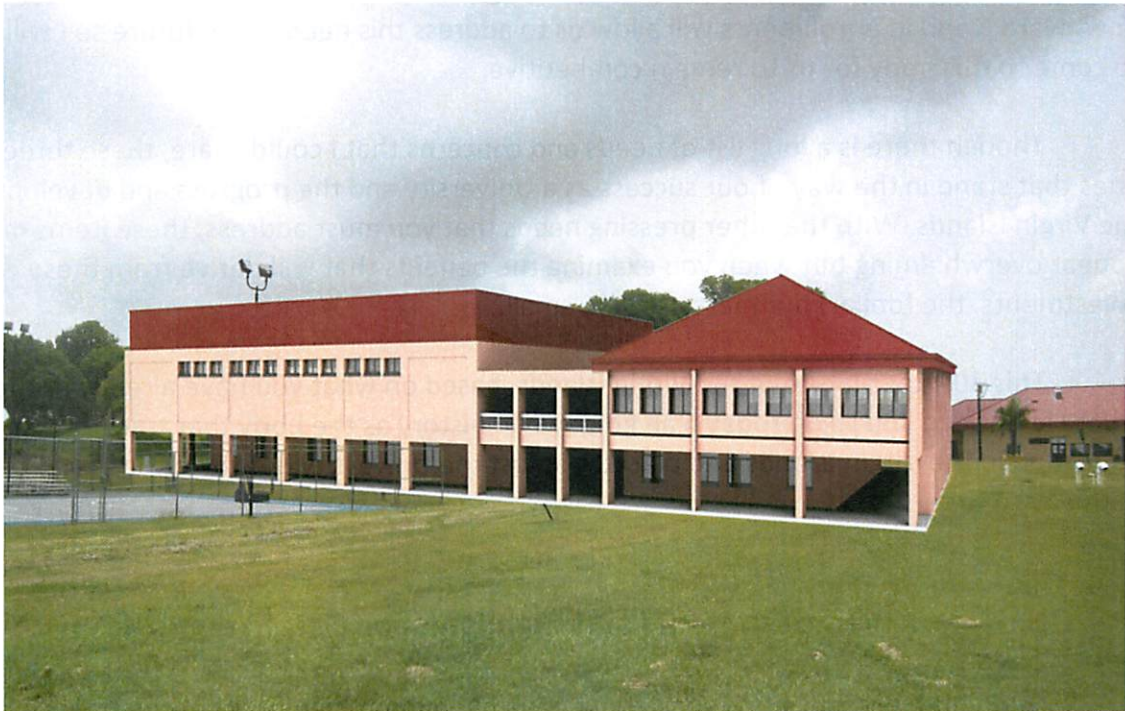
Figure 1 St. Croix Multi-Purpose Center

The third and final challenge that I wish to share with you today relates to the needs of our faculty and staff. I want to applaud and thank this body for insisting on the restoration of salary levels prior to the 8 percent salary reduction for the remainder of this fiscal year. This means a lot to all government employees, but especially those at the University. We also hope that when funds are allocated to restore it for next fiscal year the University is included. This was not the case last year and this body had to pass special legislation to make that occur.